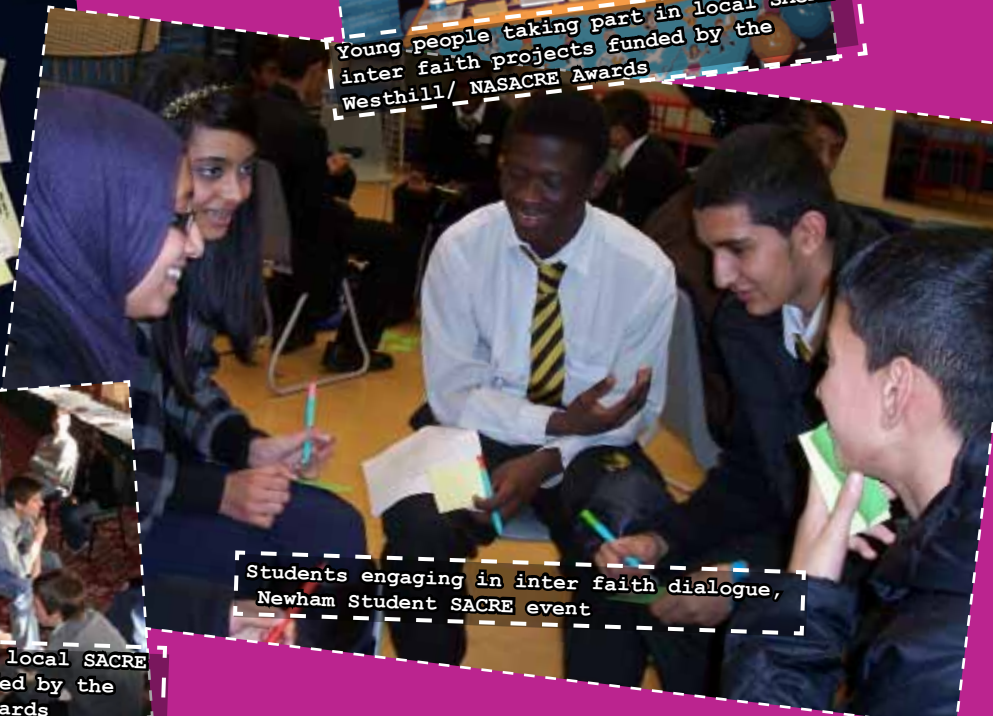
Students engaging in inter-faith dialogue, Newham Student SACRE event