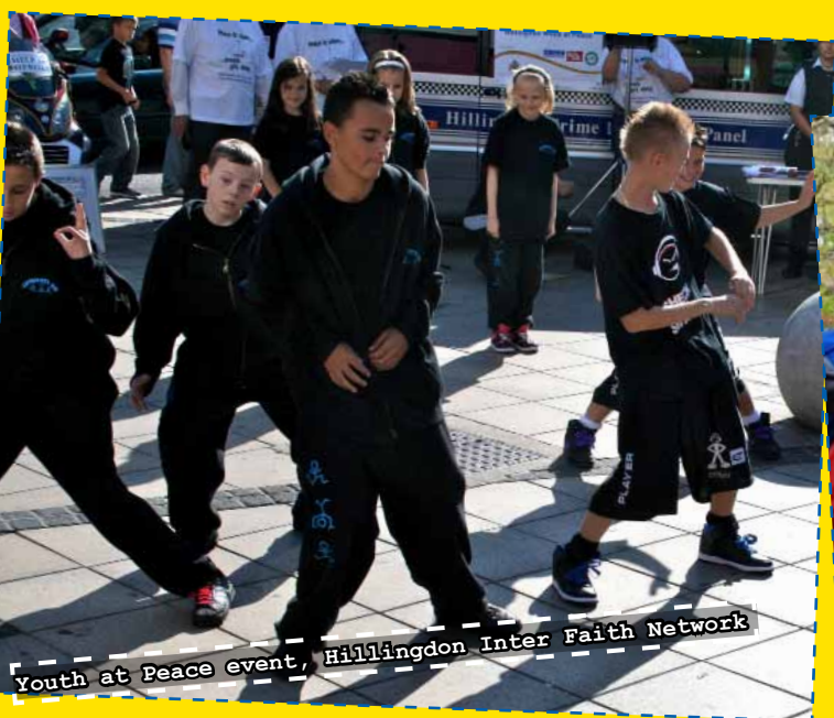
Youth at Peace event, Hillingdon Inter Faith Network