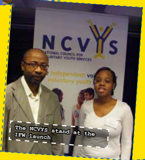
The NCVYS stand at the IFW launch