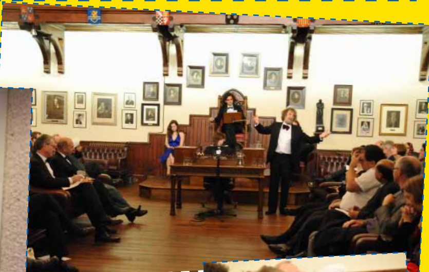
Cambridge Union Society and East of England Faiths Council Inter Faith Debate for IFW