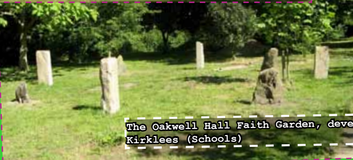
The Oakwell Hall Faith Garden, developed by Interfaith Kirklees (Schools)