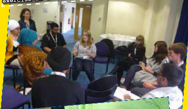
Students participating in a 'Leadership Skills' exercise at the National Student Inter Faith Forum

Higher and Further Education institutions organise, promote and take part in inter faith activities across the country. Many institutions themselves organise events – often in the form of conferences or seminars – for students to take part in. Chaplaincies often play an important role in organising and coordinating inter faith events in Higher and Further Education. Some events also involve collaboration with local community and faith groups as well as with third sector partners who provide support and expertise. Students in both Further and Higher Education may set up and run inter faith activities – supported by the student unions or existing faith societies. Events range from inter faith stalls at fairs to exhibitions and food days and can involve students, staff and members of the local community. In a number of institutions, staff and students have also set up dedicated inter faith societies.