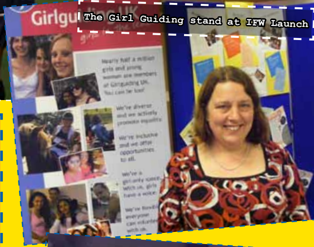
The Girl Guiding stand at IFW Launch

Youth inter faith forums are increasingly common, whether it is through young people from a number of religious youth groups engaging in dialogue or working together on a collaborative social action project in their local community, or through non-confessional youth organisations encouraging inter faith dialogue and engagement between members of their organisation who come from different faith traditions.