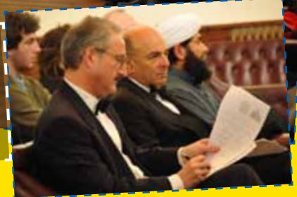
Inset: The proponents for the motion