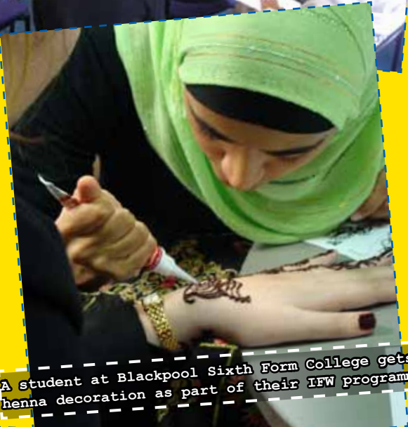
A student at Blackpool Sixth Form College gets a henna decoration as part of their IFW programme

Higher and Further Education institutions organise, promote and take part in inter faith activities across the country. Many institutions themselves organise events – often in the form of conferences or seminars – for students to take part in. Chaplaincies often play an important role in organising and coordinating inter faith events in Higher and Further Education. Some events also involve collaboration with local community and faith groups as well as with third sector partners who provide support and expertise. Students in both Further and Higher Education may set up and run inter faith activities – supported by the student unions or existing faith societies. Events range from inter faith stalls at fairs to exhibitions and food days and can involve students, staff and members of the local community. In a number of institutions, staff and students have also set up dedicated inter faith societies.