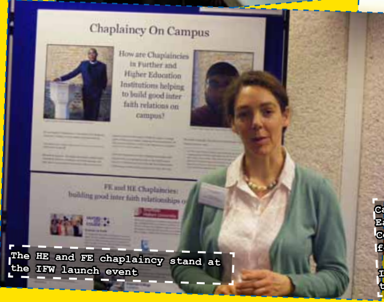
The HE and FE chaplaincy stand at the IFW launch event