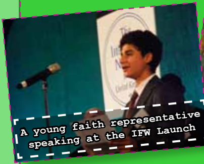
A young faith representative speaking at the IFW Launch