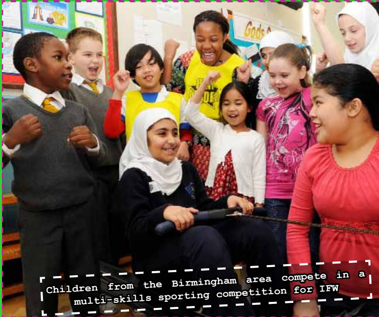
Children from the Birmingham area compete in a multi-skills sporting competition for IFW

Schools participate in a wide range of inter faith activities and learning in both the maintained and independent sectors. RE teachers often support a range of in-classroom activities with pupils from across the range of faith communities. In some maintained schools of a religious character and some independent schools, chaplains may take the lead in inter faith activities outside of the classroom. Schools also participate in whole-school activities, including special assemblies and talks by members of local religious communities.