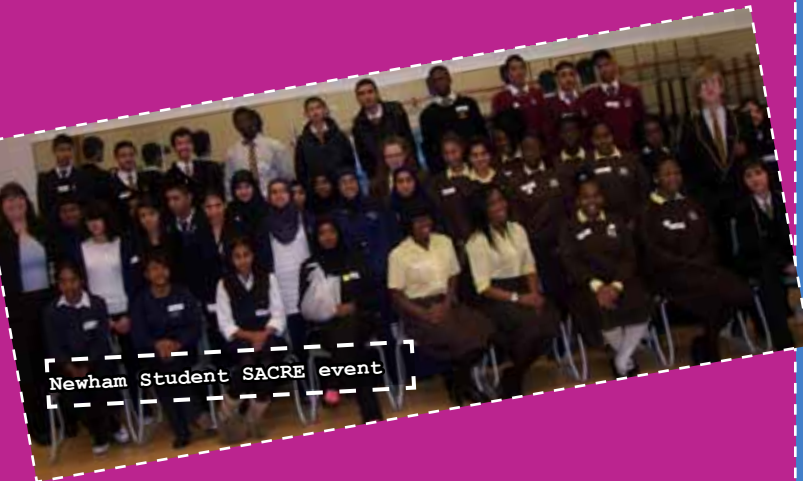
Newham Student SACRE event

Religious Education is an important and established part of the basic curriculum for maintained schools. Each Local Education Authority in England and Wales has a Standing Advisory Council on Religious Education (SACRE) which is responsible for overseeing the provision of RE and collective worship for its local authority schools. SACREs are linked together by the National Association of SACREs (NASACRE), which has taken an active role in promoting youth inter faith initiatives through awards given to local SACRE projects, funded by the Westhill Foundation.