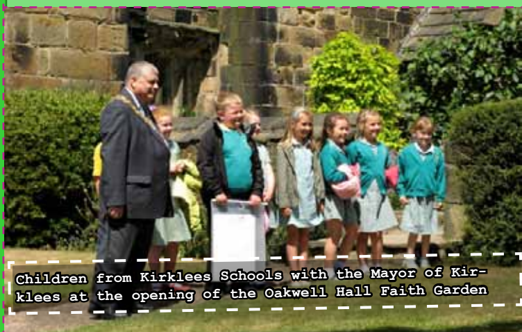
Children from Kirklees Schools with the Mayor of Kirklees at the opening of the Oakwell Hall Faith Garden