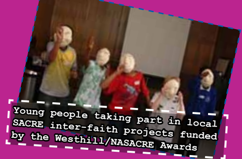
Young people taking part in local SACRE inter-faith projects funded by the Westhill/NASACRE Awards