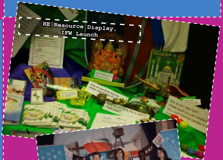
RE Resource Display, IFW Launch

Nationally, the RE Council of England and Wales draws together RE professionals, religious community leaders and other national stakeholders to advise on RE provision. On a local level, SACREs reflect in their membership local faith community representatives, teachers and others, to advise schools and decide the priority areas for local RE teaching. This helps to ensure that RE is locally relevant, and contributes to understanding and respect in the wider community. SACREs also have a role in encouraging RE teachers and schools to engage with local faith communities, including encouraging and helping to resource class visits to local places of worship.