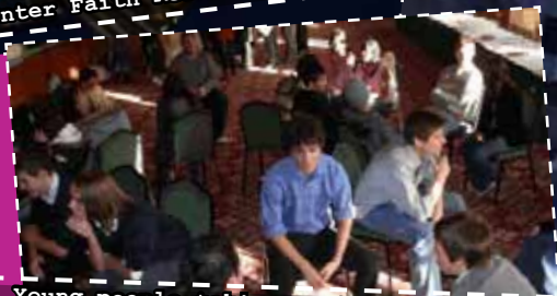
Young people taking part in local SACRE inter-faith projects funded by the Westhill/NASACRE Awards