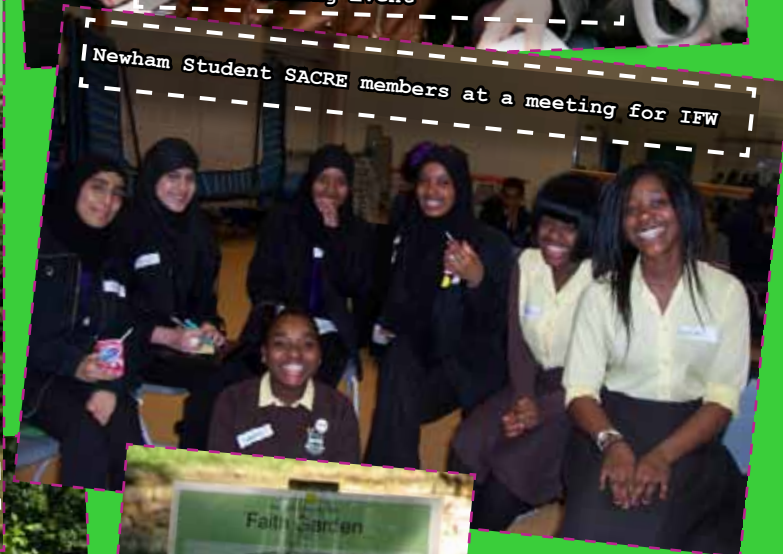
Newham Student SACRE members at a meeting for IFW