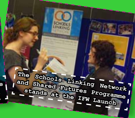
The Schools Linking Network and Shared Futures Programme stands at the IFW Launch