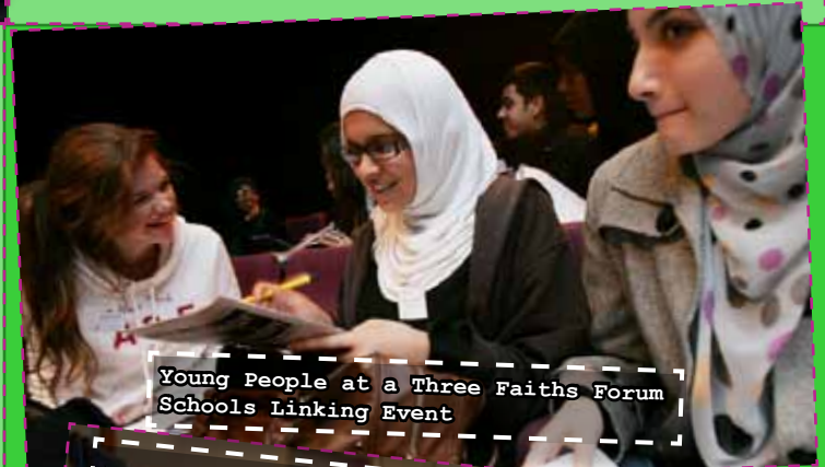
Young People at a Three Faiths Forum Schools Linking Event

RE draws together young people of all different religions and beliefs – and encourages critical self-reflection and informed, sensitive engagement with the other. Because the syllabus reflects the religious make-up of the local community – and because engagement with local faith communities is encouraged – the inter faith engagement and relationships of respect which begin in the classroom can have positive consequences for the wider community. Further, many faith schools welcome young people from different religious backgrounds and also give attention to other religions in their RE curriculum.