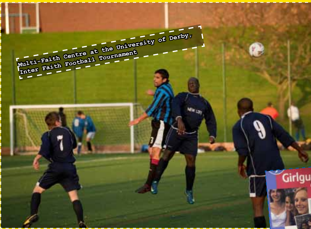
Multi-Faith Centre at the University of Derby, Inter Faith Football Tournament

Youth work in the UK comes in many shapes and sizes. Local authorities often have a dedicated youth service, responsible for providing leisure and civic facilities for young people, and employ youth workers who work exclusively with young people. Faith communities, too, will often have dedicated youth work programmes, ranging from religious instruction to leisure and social clubs. There is also a huge range of national youth charities and bodies, national, regional or local, that organise inter faith activities for young people.