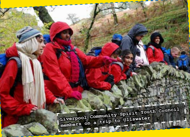
Liverpool Community Spirit Youth Council members on a trip to Ullswater