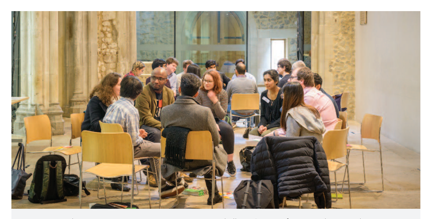
Participants in discussion at IFN Focus Group session at St Ethelburga's Centre for Reconciliation and Peace, London

"As a student, the Chaplaincy was the first place I encountered fruitful interfaith dialogue, for many people it's the prime link to those of other faiths within their universities, workplaces and schools. The role of chaplaincies in interfaith dialogue is to initiate and support discussion between their peers of different faiths; this enables them to build relationships, find shared values and do remarkable things together. In my university life, the links within the chaplaincy have been responsible for some of my most treasured friendships. Chaplaincies are an excellent place to start if you're interested in getting to know people a little bit different from yourself."