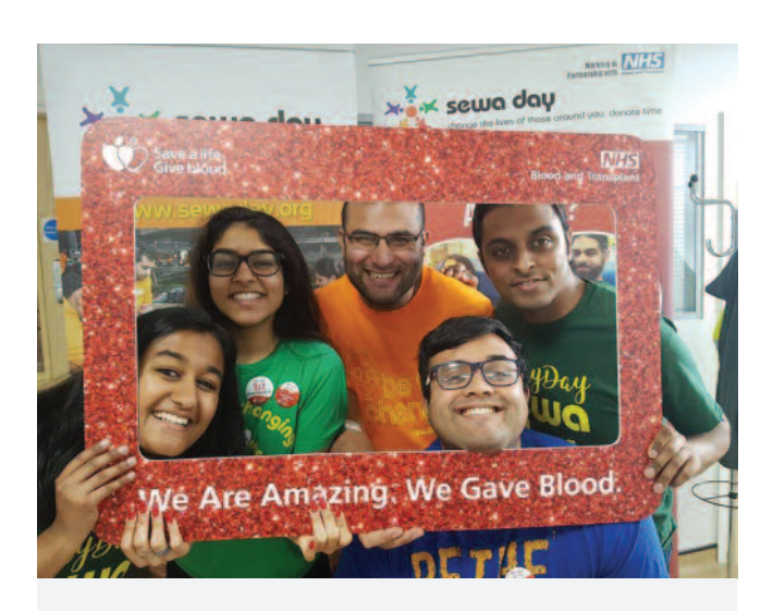
People donating blood to the NHS as part of a Sewa Day project