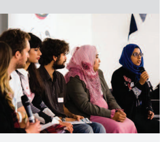
Panel discussion at the Faith and Belief Forum's annual Interfaith Summit

The Youth Council of the Faith and Belief Forum organise an annual 'Interfaith Summit', coinciding with national Inter Faith Week. Young people from diverse faith and belief backgrounds come together to connect, explore and act. It provides them with a space to discuss current issues including race, the environment, mental health, and sexuality. It's a space for honest and open dialogue that leads to real action.