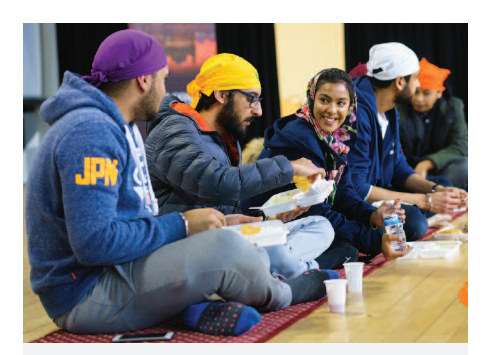
Liverpool students taking part in 'Langar on Campus' organised by the Liverpool Sikh Society

Religious beliefs, rooted in the scriptures and teachings of the different faiths, as well as particular ethical beliefs, have a bearing on what some participants will eat and drink.