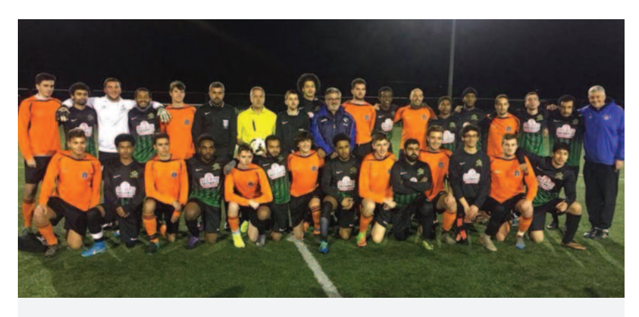
Youth on Solid Ground interfaith football match

Inter Faith Week is a great time to try out these sorts of activities, perhaps even as part of a programme of events. See page 35.