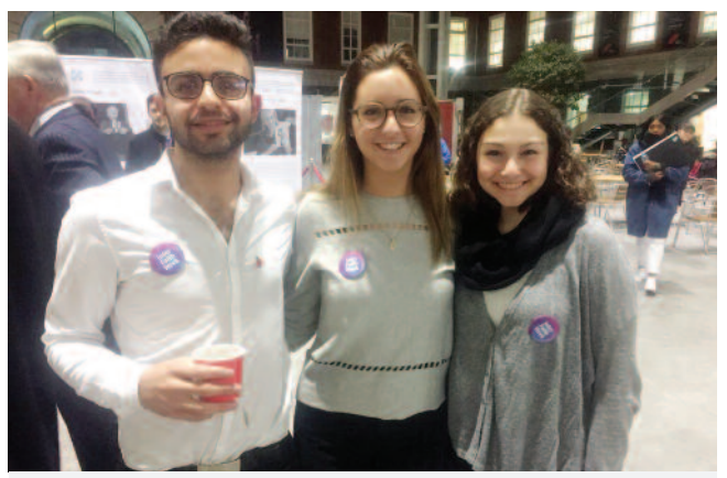
Members of the Union of Jewish Students at an Inter Faith Week event in Barnet

building on the contribution which their members make to their neighbourhoods and to wider society