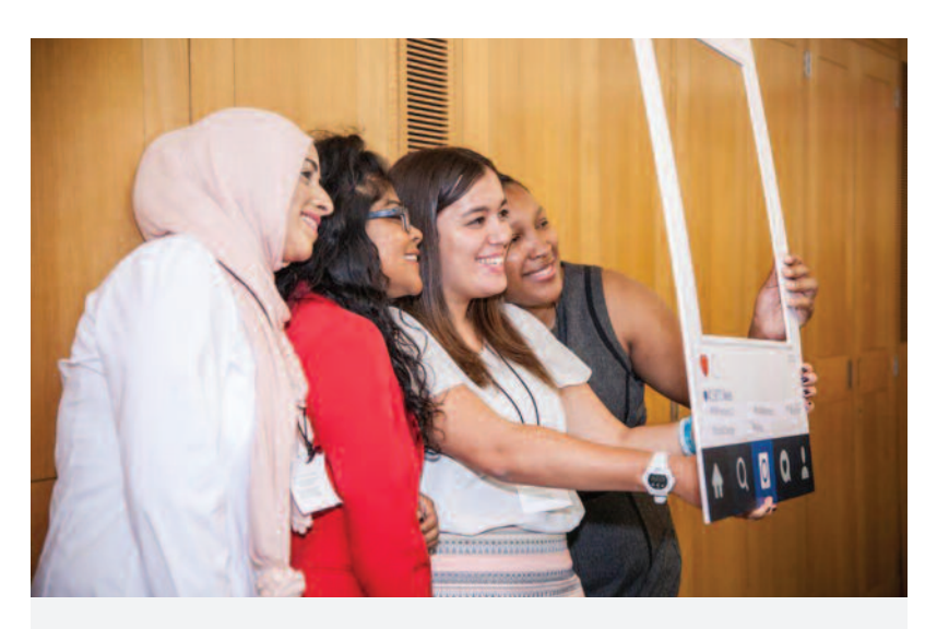
Faith and Belief Forum ParliaMentors posing for a selfie