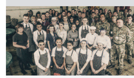
Participants in the special lunch to launch the Faith, Forces and Food project

During Inter Faith Week, the St Philip's Centre, Leicester, launched 'Faith, Forces and Food'. The project was launched with the help of catering students of different faiths at Leicester College, who hosted a special lunch for over 60 participants. The project aimed to bring together members of the British Armed Forces with diverse communities across the city to share food and get to know one another. Lunches and dinners took place every day of the Week, and involved members of eight faith communities.