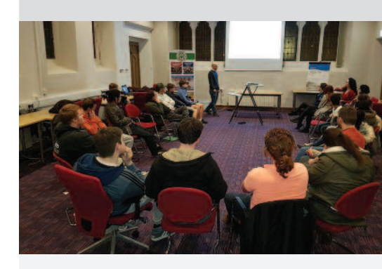
Members of Youth Voices Collective at the North West Islamic Association in Derry

The Youth Voices Collective is a group of young people from diverse backgrounds in the Derry and Strabane Council area, Northern Ireland. It is part of a programme of activities looking at radicalisation, politics and good relations in Northern Ireland. They visited the North West Islamic Association in Derry for a dialogue and workshop about Islam and Muslim culture and identity.