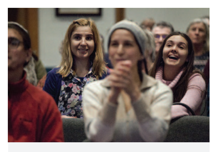
Participants at an annual launch event for Scottish Interfaith Week

Week is led by Interfaith Scotland. It provides an opportunity for individuals, local inter faith groups, faith communities, organisations and educational bodies to celebrate Scotland's religious diversity and plan events that bring local people together to promote dialogue, understanding and co-operation. It takes place across the same dates as Inter Faith Week in the other nations, and also has a dedicated website scottishinterfaithweek.org. There is a theme for the Week each year which provides a focus for dialogue. These have included Connecting Generations, Creativity and the Arts, Religion and the Media, and Caring for the Environment.