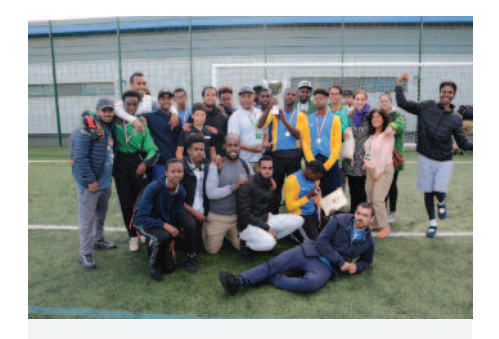
Islington Faiths Forum's 'Peace Cup' football tournament