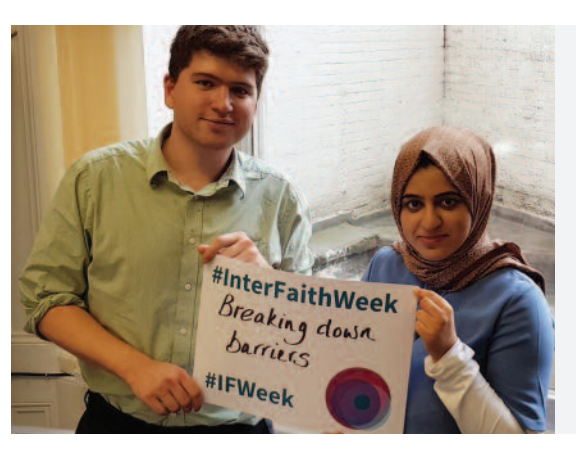
Taking part in an Inter Faith Week Twitter campaign