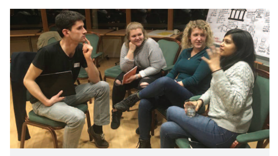
Students at a Faith and Leadership event organised by the LSE Faith Centre