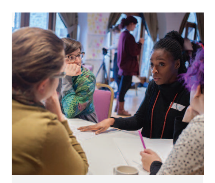
Participants at a training event for youth workers on interfaith dialogue