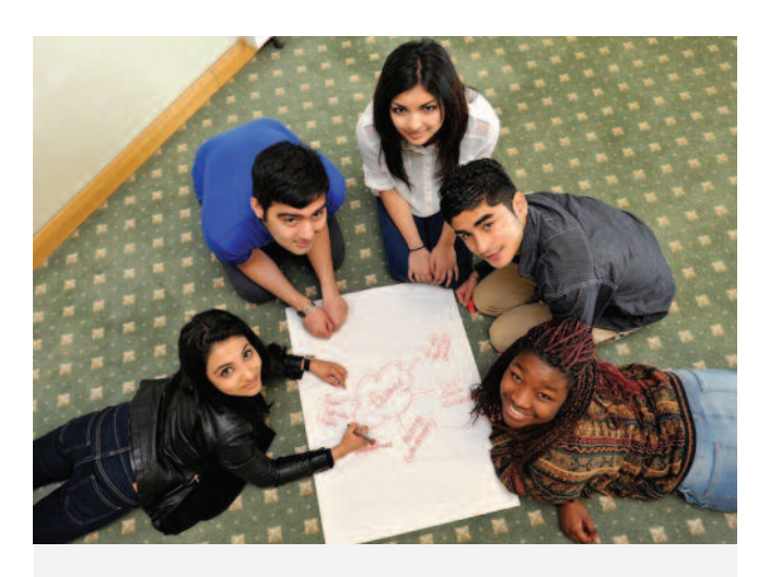
Participants in the Near Neighbours Catalyst programme

If you are at university or in further education, contact your Student Union or faith or belief society. The National Union of Students encourages student unions to become involved in building good relations on campus: www.nusconnect.org.uk/learning-resources/faith-and-belief/good-campus-relations